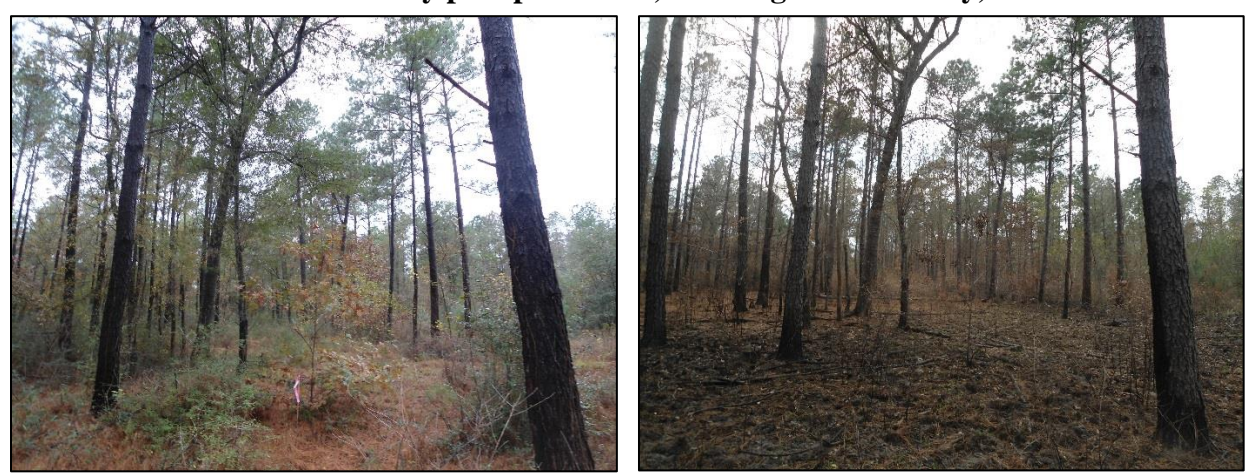
Mixed Pine-Hardwood Stand, Angelina County, 144 acres