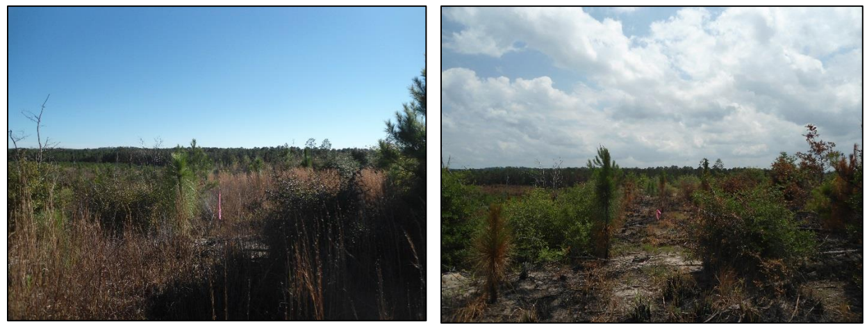
Longleaf pine, Jasper County, 203 acres