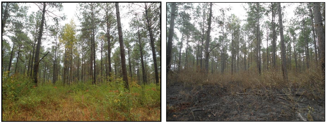
Mid-rotation loblolly pine plantation, San Augustine County, 270 acres